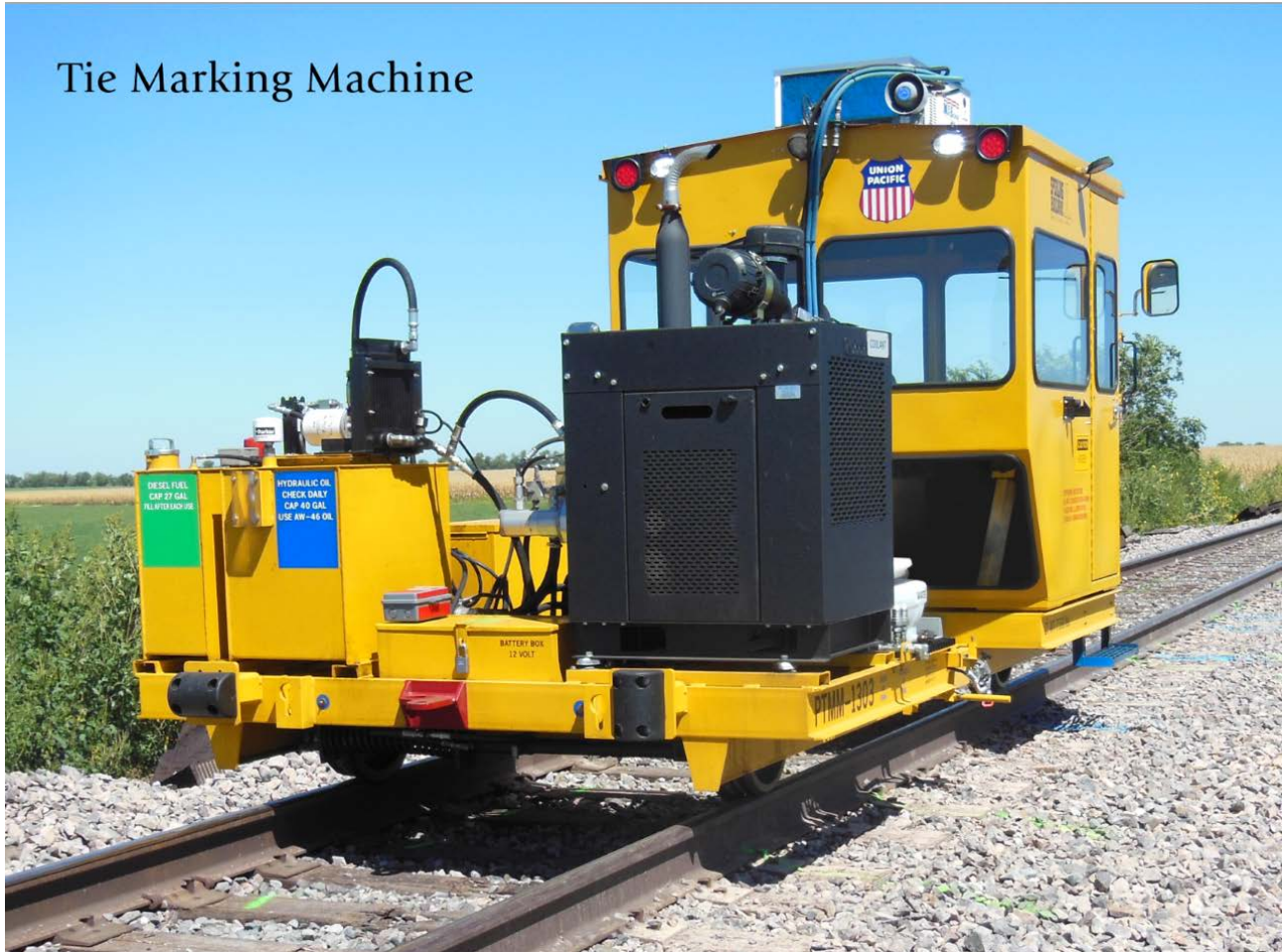
Tie Marking Machine